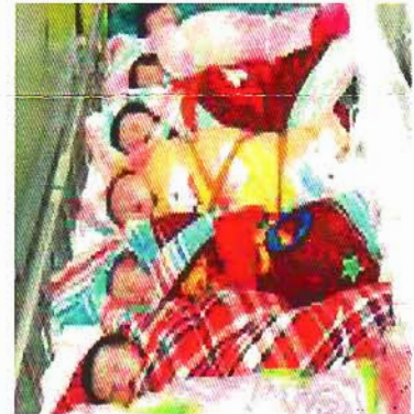
Abandoned children in China.....

We KNOW THAT ~EVERYONE IS SOMEBODY'S CHILD~